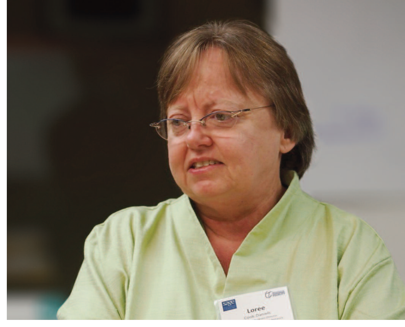
October 2011 meeting of the Advisory Committee for the Transgender Aging Advocacy Initiative, Washington, DC.