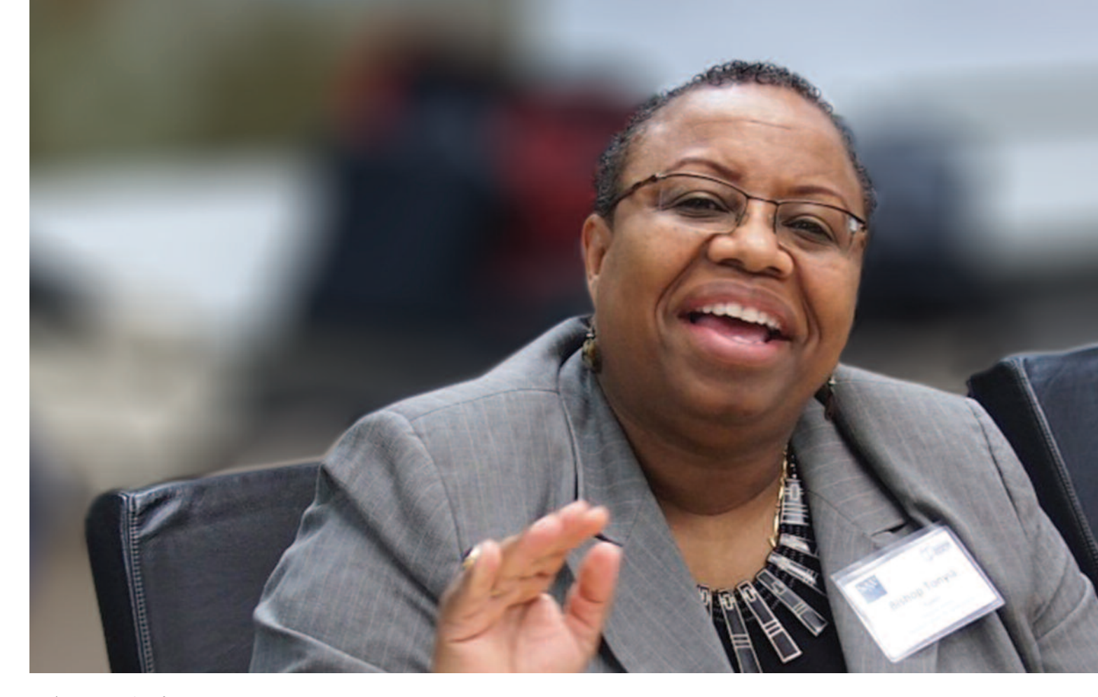
October 2011 meeting of the Advisory Committee for the Transgender Aging Advocacy Initiative, Washington, DC.

The available research shows that most aging agencies and facilities do not offer cultural competency trainings to their staff or residents about issues related to serving transgender clients. According to a 2009 nationwide study of area agencies on aging, only one-third of the participating agencies had offered their staff training on LGBT aging, and most of these training sessions were voluntary or part of a generalized training on nondiscrimination. The study found that conducting cultural competency trainings correlated to increased engagement with transgender elders. The 101 agencies that had conducted trainings specifically on transgender issues were three times more likely to report having received a request to help a transgender older adult in the previous year.