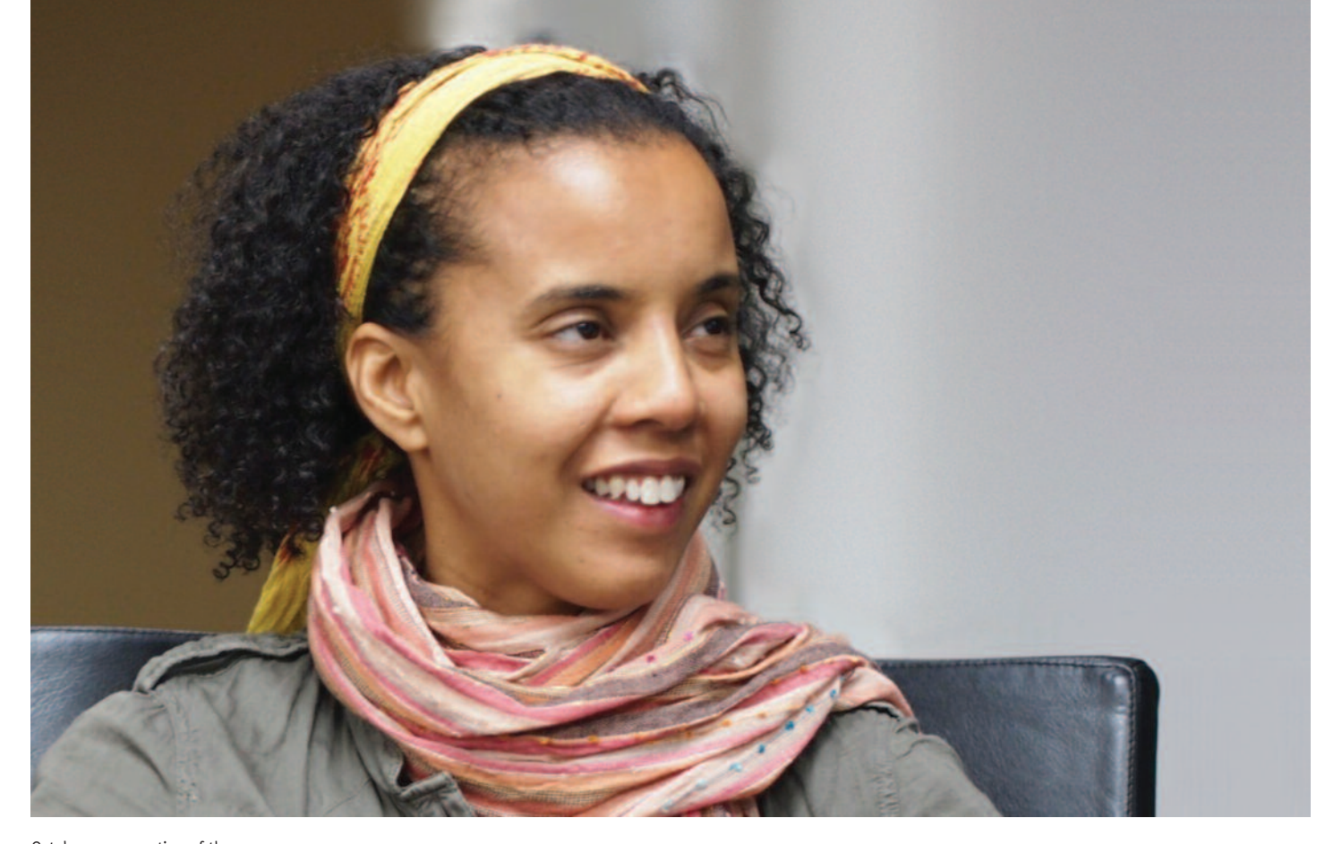
October 2011 meeting of the Advisory Committee for the Transgender Aging Advocacy Initiative, Washington, DC.

consistent and respectful care at VA facilities nationwide. The Transgender American Veterans Association (TAVA) published a survey in 2008 that found that respondents reported "organizational discrimination at the VA in a lack of clear and consistent practice, with little support for gender transitions...there were many reports of interpersonal discrimination, via lack of respect from VA doctors, non-medical staff, and nurses." <sup>56</sup>