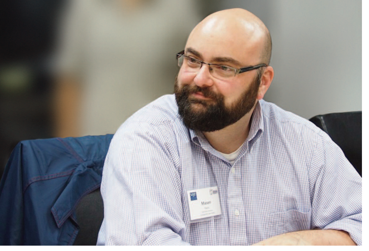
October 2011 meeting of the Advisory Committee for the Transgender Aging Advocacy Initiative, Washington, DC.