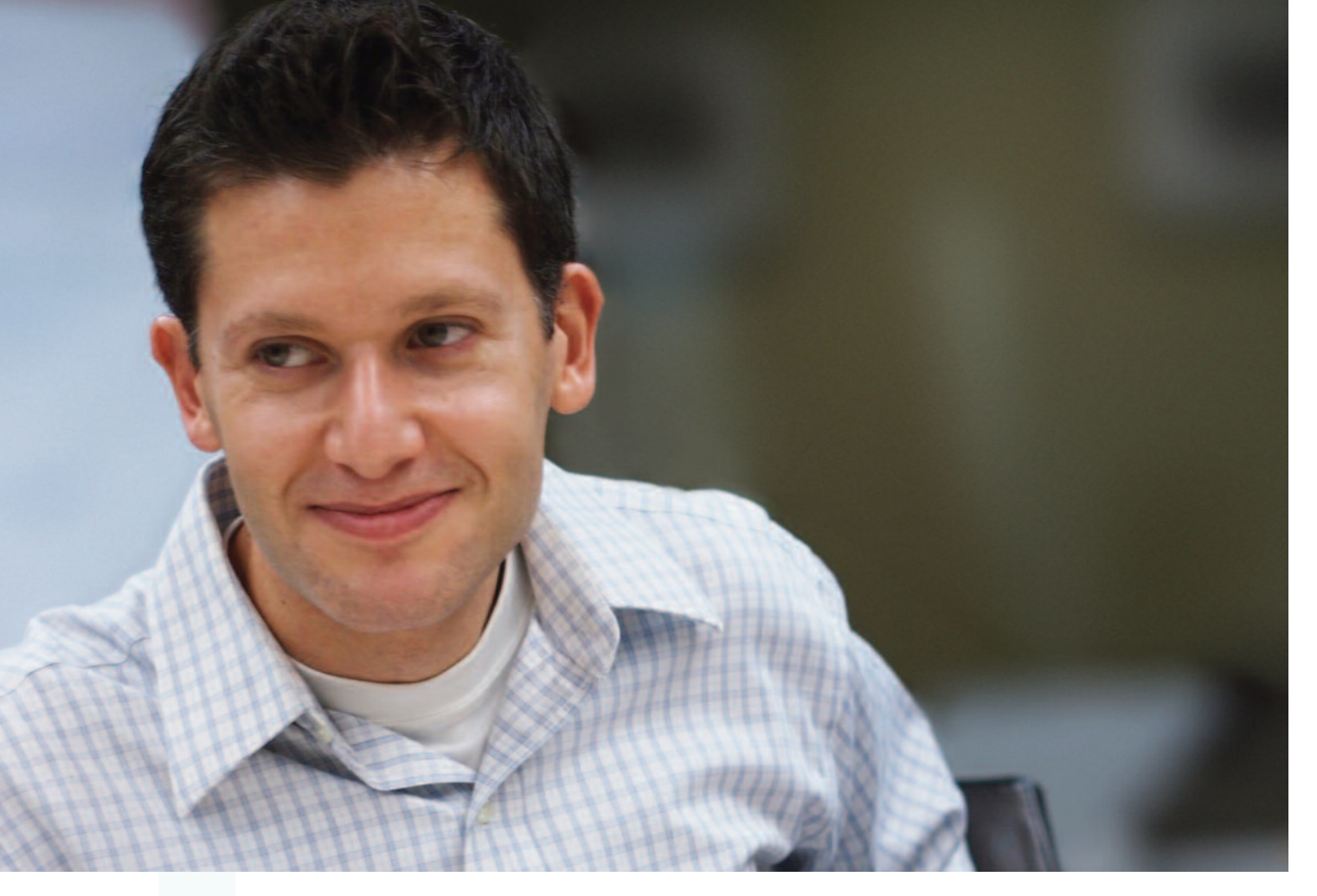
October 2011 meeting of the Advisory Committee for the Transgender Aging Advocacy Initiative, Washington, DC.

many transgender older adults are living with HIV/AIDS, as well as the medical and other needs of older transgender people living with HIV/AIDS.<sup>37</sup>